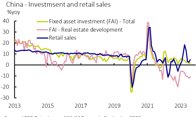
Exhibit 3: Real estate lags investment and consumption