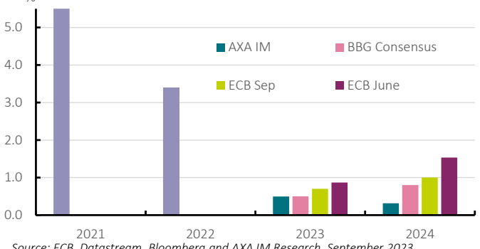
Euro area - Annual GDP forecast %